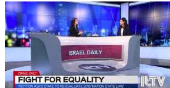
ACRI Foreign Spokesperson on ILTV discussing Nation-State petition.