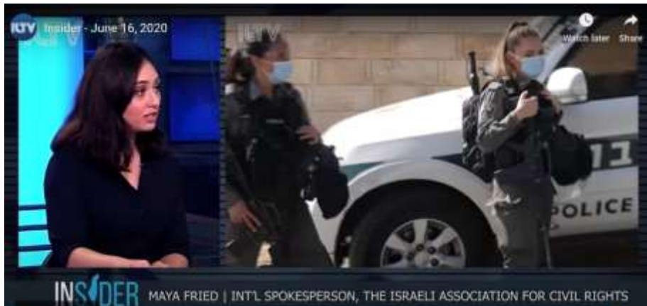
ACRI Foreign Spokesperson on ILTV discussing police profiling with Supt. Mikey Rosenfeld, International Spokesperson for the Israeli Police.

The enormous number of cases and individual complaints received by human rights organizations, published in the media, or disseminated in social networks combine to form a cohesive indication of a systemic policy. In addition to taking deterrent actions against individual officers, the police must also recognize that this is indeed a systemic problem, and must address it accordingly. Among other actions, this requires guidance, training, and the presentation of a clear message by senior officials regarding the obligation incumbent on the police to protect the right to protest.