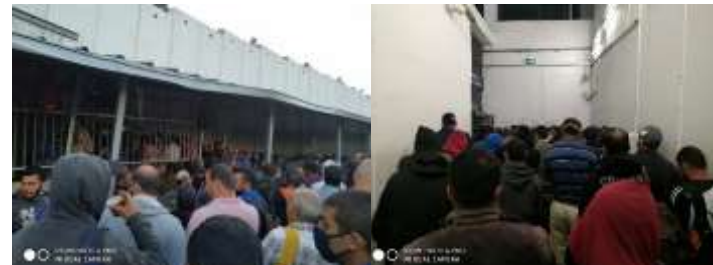
Palestinians waiting to pass into Israel via Checkpoint 300.

On 15.12.20, ACRI filed an urgent petition to the High Court of Justice regarding the overcrowding at checkpoint 300 between Bethlehem and Jerusalem. The petition is based on witness observations made by ACRI's fieldworker, who gathered during multiple morning visits that the congestion is caused principally by its manner of operation. At a time when overcrowding is more dangerous than ever, the checkpoint is likely a dangerous site of infection under the military's increasingly ineffective supervision. The High Court hearing on the petition is set for March 2021.